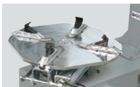
10"-20" / 11"-22" 标准的转盘 Standard chucking table.