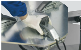
10" -24" 转盘的夹具位置可以调节 (具有两个插槽) Chucking table with adjustable positioning of clamps (2 slots).

The frame is large and reinforced, to grant the utmost rigidity to the structure and chucking table. The gear box is installed between two steel plates, to avoid flexion during operation. The extra height of the vertical post and tool shaft allow operation on tyres to a max. of 15" (381 mm) width.