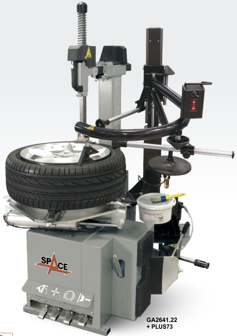
GA2641.22 + PLUS73